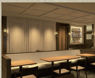
米沢牛黄木 東京駅店 [ 東京駅グランスタ八重北内 ]