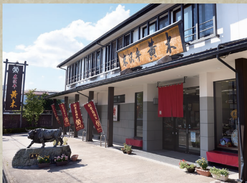
米沢牛黄木 総本店 山形県米沢市桜木町 3-41

Yonezawa beef Oki celebrated its 100 th anniversary in 2023