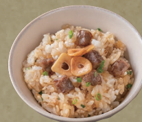
Garlic rice with Yonezawa beef Allergic substances: wheat, soybean, beef ¥800