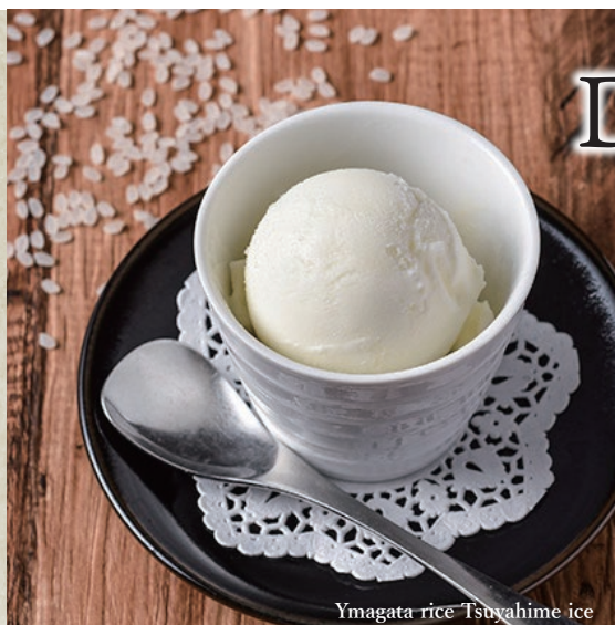
Ymagata rice Tsuyahime ice

Makes the most of the original taste of Yamagata local ingredients, bringing it with natural sweetness