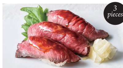
Yonezawa roast beef sushi Allergic substances: wheat, soybean, beef ¥1,500