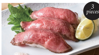
Yonezawa Seared Otoro(fatty meat)Sushi Allergic substances: wheat, soybean, beef, orange ¥1,800