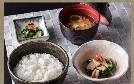
Side meal 【kobachi, rice, miso soup, pickles】 Allergic substances: wheat, soybean ¥800