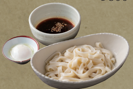
Spicy dipping udon with Yonezawa beef Allergic substances: wheat, soybean, beef, egg, shrimp, crab ¥900